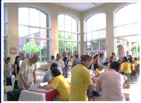
Housing counselors and volunteers from the Center for Pan Asian Community Services at a housing fair in Atlanta, GA

(continued from pg. 7) Challenges Navigating the Housing Process Faced By Asian American and Pacific Islander Families